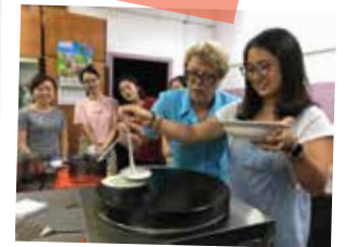
Summer Trip to Russia