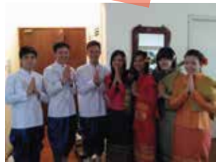
Activities of Thai Class