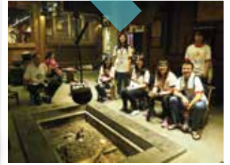
Cultural Trip to Chongqing