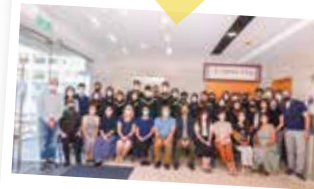
Undergraduate Photo Taking