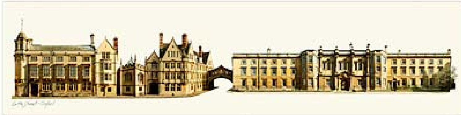
Long Street - Oxford