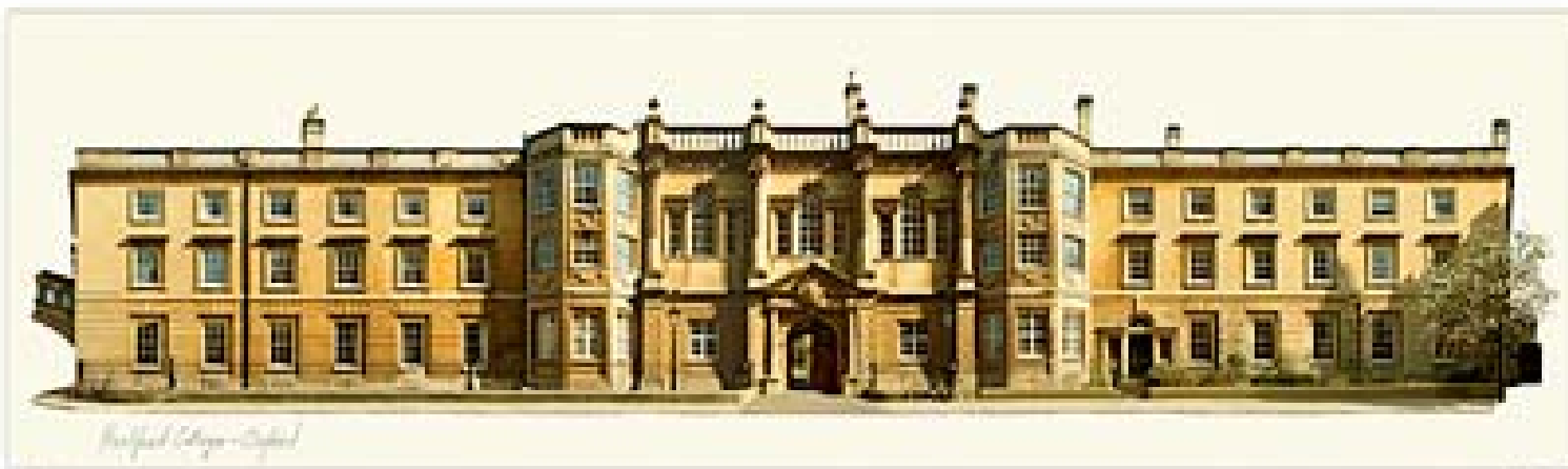
Balliol College - Oxford