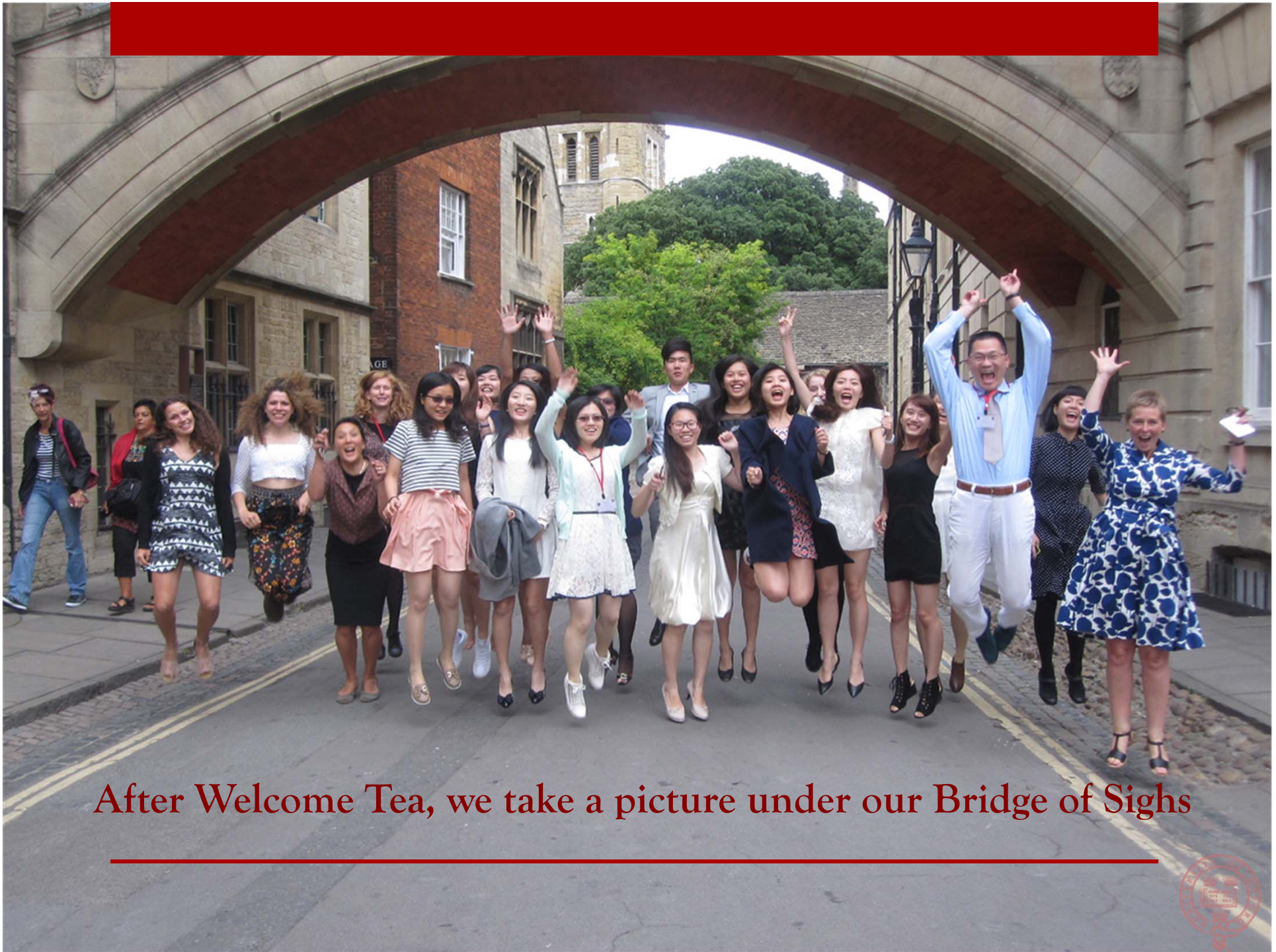
After Welcome Tea, we take a picture under our Bridge of Sighs