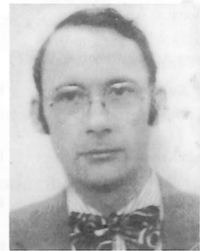
Looking groovy on a library card from the 70s

How can I repay such an opportunity? Let me promise to do the best teaching, writing and learning I am capable of doing, and dedicate my remaining output to the gardeners, the bus drivers, the canteen staff, the swimming pool attendants, the tea amahs, the technicians, and the executive office assistants whose good cheer and reliability in doing their work has released me to do mine. We drink from the same clear stream.