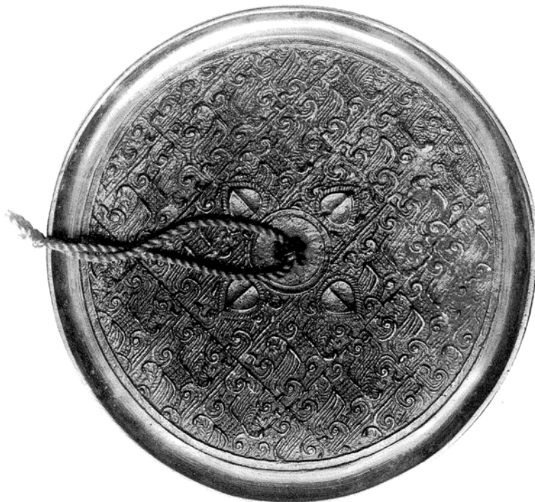
Bronze mirror with leaf petals on a ground of spirals; Warring States, 3rd Century B.C. Lent by S. Y. Kwan (Exhibition of Ancient Chinese Bronzes)