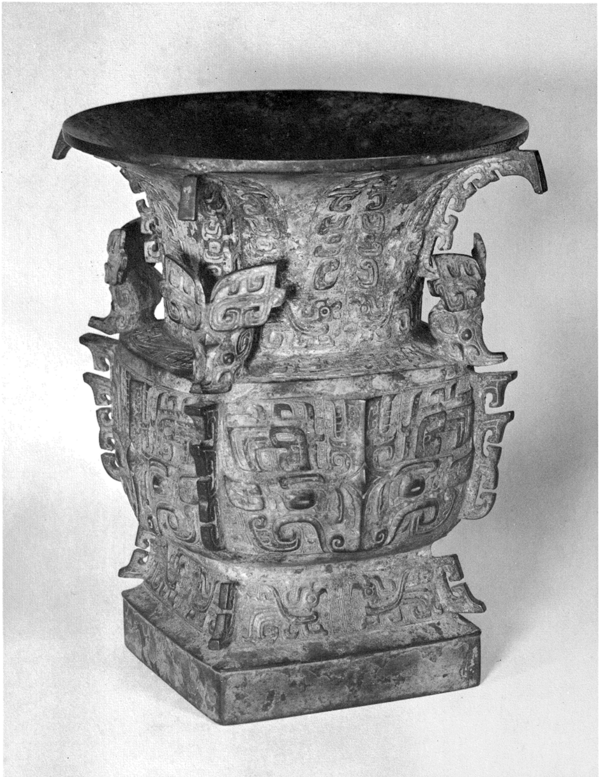
Bronze jun with taotie design; Mid-Western Zhou, c. 10th Century B.C. Lent by Bei Shan Tang (Exhibition of Ancient Chinese Bronzes)