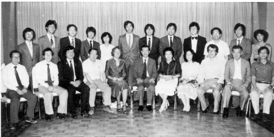
Staff and students of the Department of General Business Management and Personnel Management