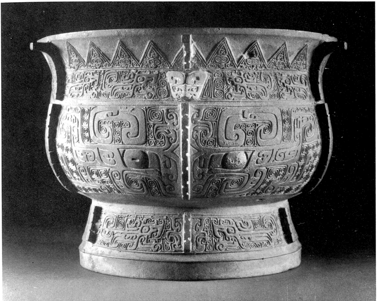
Bronze gui with taotie and kui-dragon design; Early Western Zhou, c. 11th to 10th Century B.C. Lent by Bei Shan Tang (Exhibition of Ancient Chinese Bronzes)