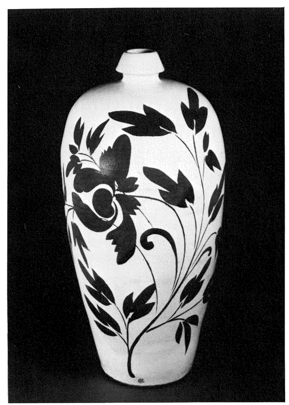
Meiping vase with a painted floral spray; Song to Jin; Height: 41 cm (From the collection of the Guangdong Museum of Folk Arts)

In addition, specimens unearthed from the Xicun kiln site in Guangzhou constituted another special feature of the Exhibition. They were on view outside China for the first time since the discovery of the kiln site in the fifties. Placed alongside the Xicun wares acquired in the Southeast Asian countries by the Art Gallery, the varieties of the Xicun products