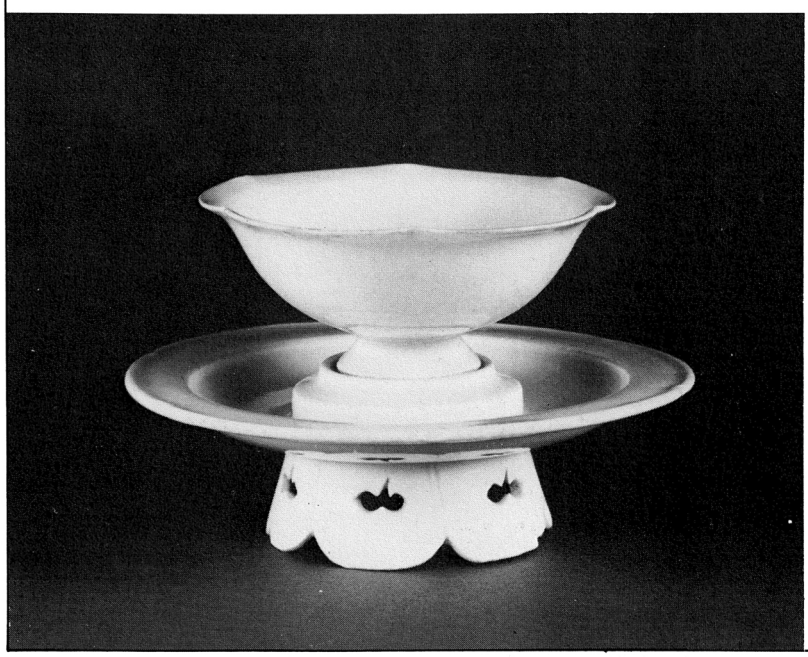
Qingbai cup and stand; Song; Diameter: 15 cm (From the collection of the Guangdong Museum of Folk Arts)