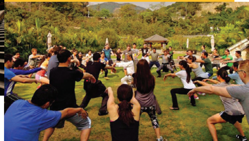
Exceptional Chinese Culture Experience: Participants learn the concept of "The Doctrine of the Mean" in Chinese way of thinking through Chinese Martial Arts.

Everything was very well-planned and I got new insights to understand better the Chinese culture and business culture. Thank you!