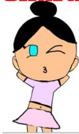
Krystal (Kaleb's younger sister)