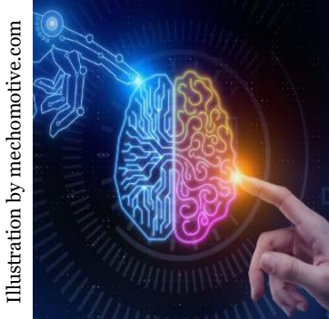
Illustration by mechomotive.com

As graduate students, the main organ of our body we employ is our brains, and the main action we require of it, is learning. Yet, none of us has undergone training in what conditions make learning effective - i.e. learning about learning, or "Metalearning". We're like athletes who have no idea about the human body and the optimal conditions that make it achieve demanding tasks: at best, we are under-performing, at worst we are creating long-term damages.