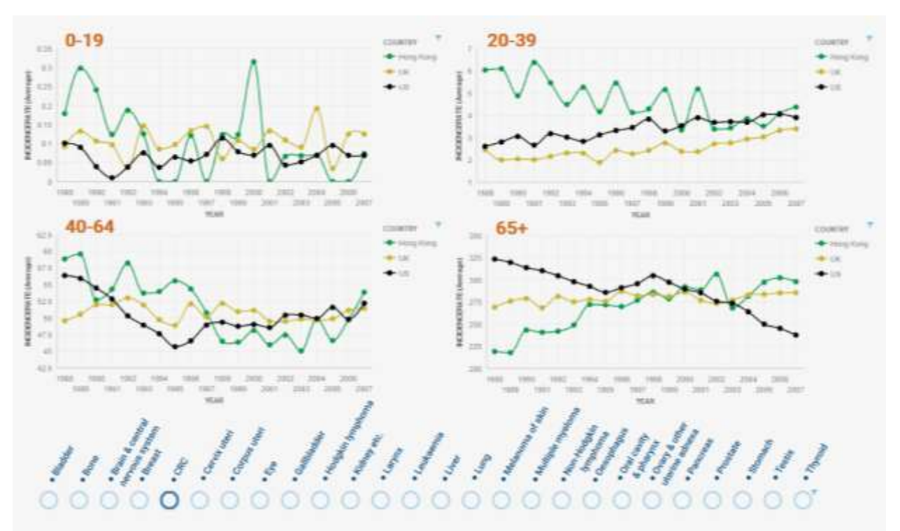
Figure 3. Cancer Incidence Trends across Different Age Groups

population. In the US and Sweden, the incidences of prostate cancer among the subjects aged between 40 and 65 increased dramatically compared with other regions. Further clinical investigation should be conducted to confirm the trends.