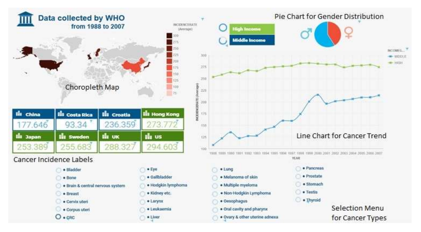
Figure 2. Overview of the Interactive Functions on the Plots

When we switched CRC to other cancers in the selection menu, we can immediately explore the global cancer trends. We also prepared a matrix to show the five common types of cancer (breast, colorectal, liver, lung, and prostate cancer) across different age groups (Figure 4). Cancer incidences were generally increased in breast, colorectal and