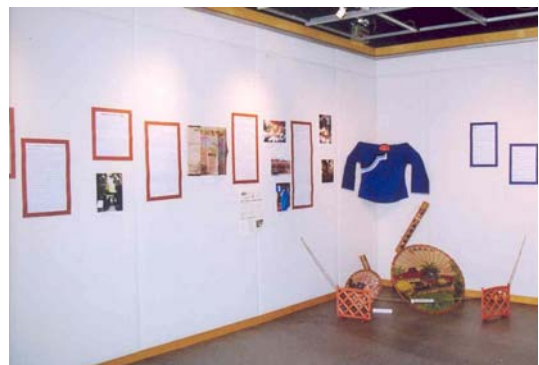
Part of the exhibition 展覽廳一角