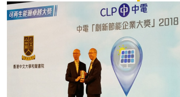
College has been awarded with Renewable Energy Outstanding Award at CLP Smart Energy Award 2018 書院於中電「創新節能企業大獎」2018 中獲可再生能源卓越大獎