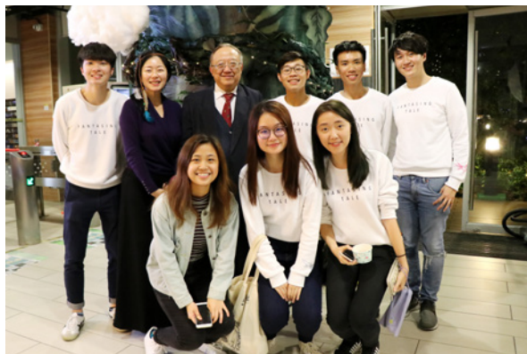
WSSU anniversary celebration team 2019 學生會院慶團隊

Apart from choir, green life ambassador and sports teams, and events organized by the College, students are encouraged to join the ten student bodies and associations registered under the College Student Union (WSSU). WSSU organizes several large-scale events, such as orientation camp and College anniversary celebratory events.