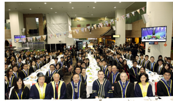
High table dinner 高桌晚宴

The curriculum of the core induction course of general education is different from traditional lectures. It emphasizes interaction between teachers and students. Through discussion, visits and other activities, students could explore issues and problems facing by University students with instructors and other students. Besides, students are required to attend non-credit bearing College assemblies and high table dinner regularly. The activities aim to enhance the general knowledge of students outside of their major studies. Renowned speakers of various disciplines would be invited to deliver talk on topics including social, ethical, cultural, religious, political, artistic and aesthetic issues, during assemblies and high table dinner.