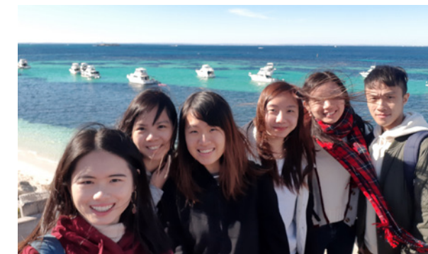
Western Australia Experience Trip 2019 西澳洲體驗之旅

優秀的領袖必須具備國際視野和真知灼見。為擴闊同學的國際視野及鍛鍊他們的獨立能力，書院提供多個海外和國內的長期學術交流計劃及短期交流項目。長期交流計劃地區包括澳洲、加拿大、中國大陸、丹麥、德國、意大利、日本、韓國、新加坡、瑞典、英國及美國，而短期交流計劃地區則包括澳洲珀斯、中國西安、新疆及哈爾濱等。除交流活動外，書院亦為學生提供獨特的體驗學習活動，讓學生擴闊眼界之餘，更能從中學習各項領導才能。