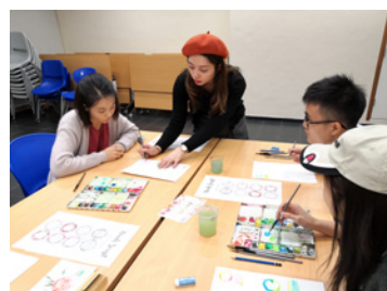
Workshops under Onboarding Programme 和聲啟程計劃下的工作坊系列