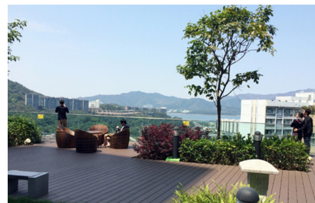
View from Courtyard 從庭園遠眺八仙嶺景色