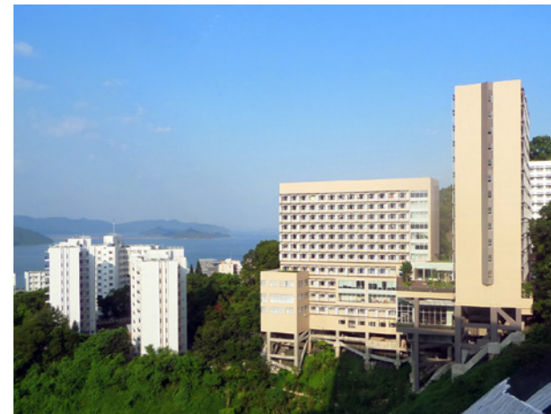
View of valley where College situated in 書院位於士林路山谷一景