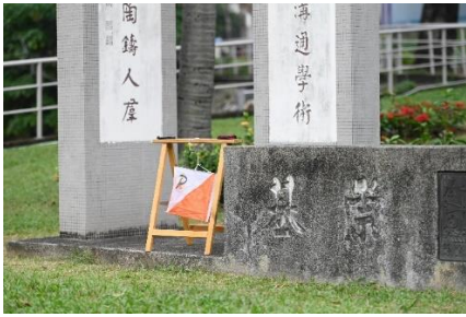
Control point on the ground