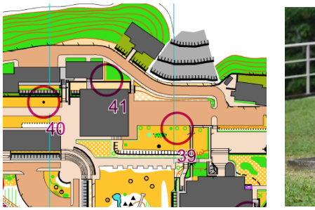
Control points shown on map