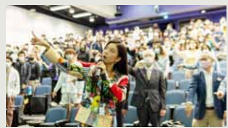
書院於上學期舉辦共五次書院論壇, 讓同學與不同界別的人士交流,增廣識 見。