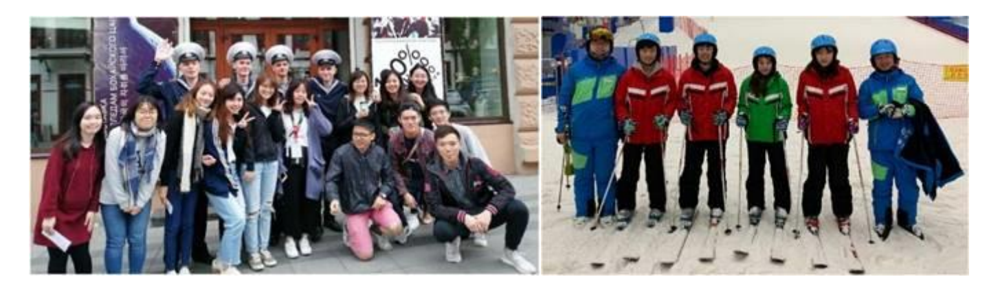
Under the assistance and guidance of Harbin Institute of Technology (哈爾濱工業大學), 10 Sunnies and 20 CUHK students from other Colleges visited Harbin and Russia in June.