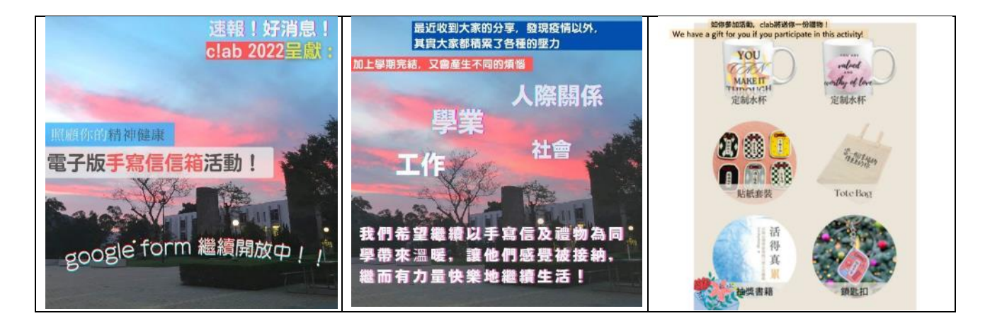
我哋手寫信箱活動繼續進行呀!!最近完 sem 大家可能又有另一方面嘅煩惱,不如今次又分享下啦

<以下內容由創意實驗室學生委員會成員撰寫 The following message is drafted by the student conveners of clab >