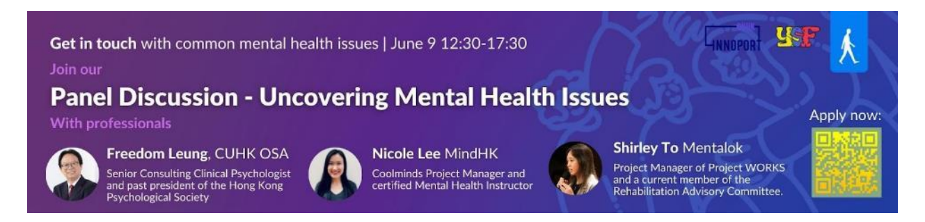
Track 2: Mental Health (SDG 3)