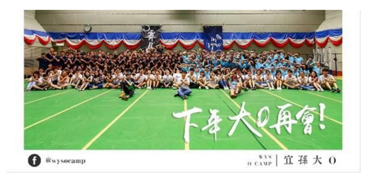
2018 College Orientation Camp & Welcoming Dinner 2018 書院迎新營&迎新晚宴

The 2018 College Orientation Camp was successfully held from 27<sup>th</sup> to 30<sup>th</sup> Aug. To echo with the theme "Dream Free Fly High" (自由幻夢), the Organizing Committee designed a variety of activities to let the freshmen embrace possible challenges in their upcoming university life. "Detective Game", "City Hunt" and "Evening Party" provided chances for participants to befriend with their peers and learn from each other. Be it a happy or challenging experience, the participants stood side by side and will certainly grow together in our College.