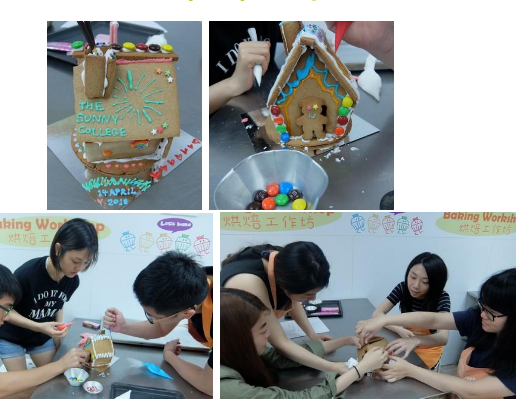
Split into 2 teams, participants of this team building workshop gave their best in baking the best cookie house in unity last Saturday. Baking skills helped but were not essential --- what they needed and experienced was patience, communication and understanding of the others. Be the participants experts or newbies of bakery, everyone learnt something new in the workshop through the roller coaster of laughter, argument, frustration and sense of achievement!