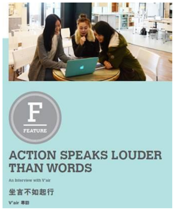
Sunny Post Issue #23

Curious about their journey from scratch to success? It's all in the Feature of the latest issue of Sunny Post!