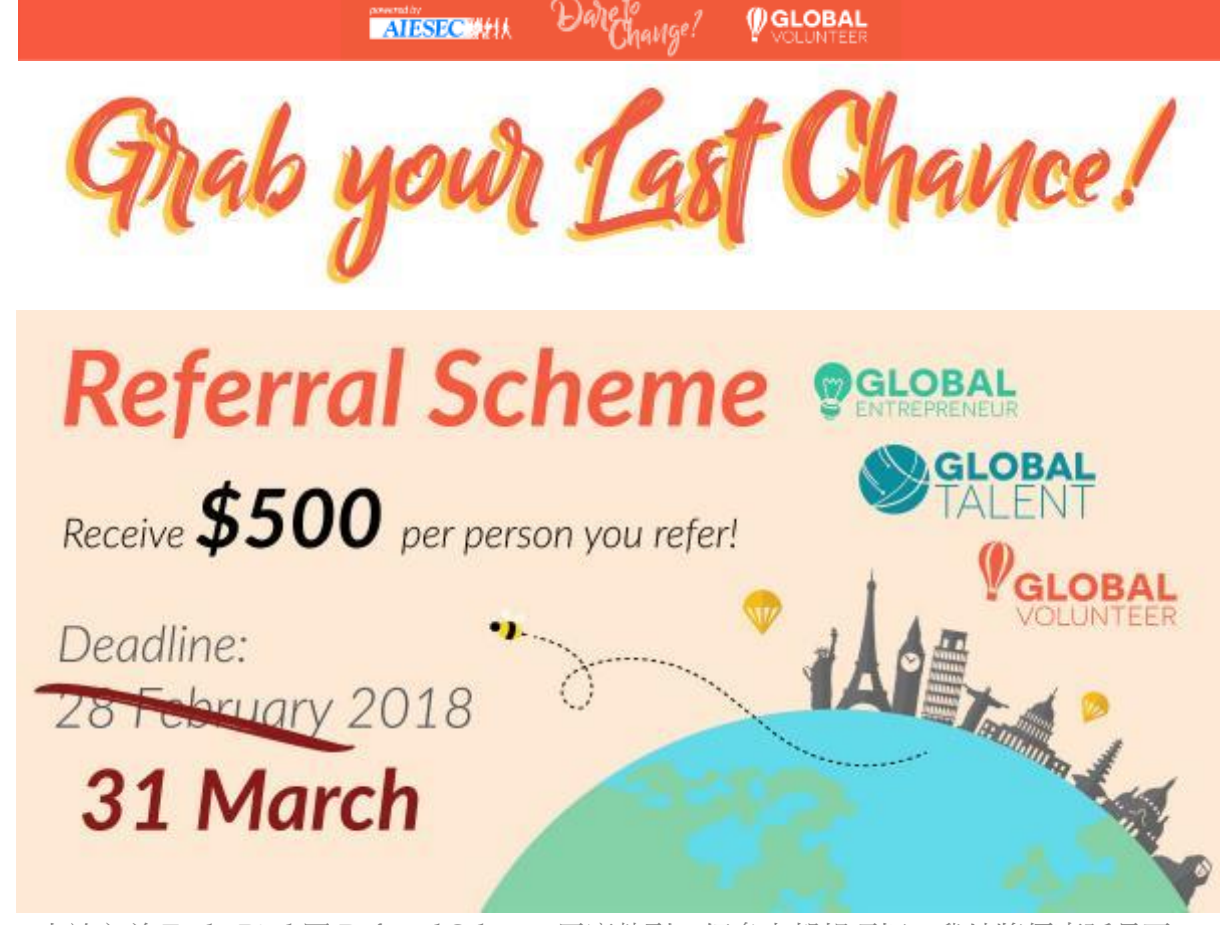
由於之前 Early Bird 同 Referral Scheme 反應熱烈,好多人都報唔切,我地將優惠延長至:

1. AIESEC in CUHK - Volunteer Programmes