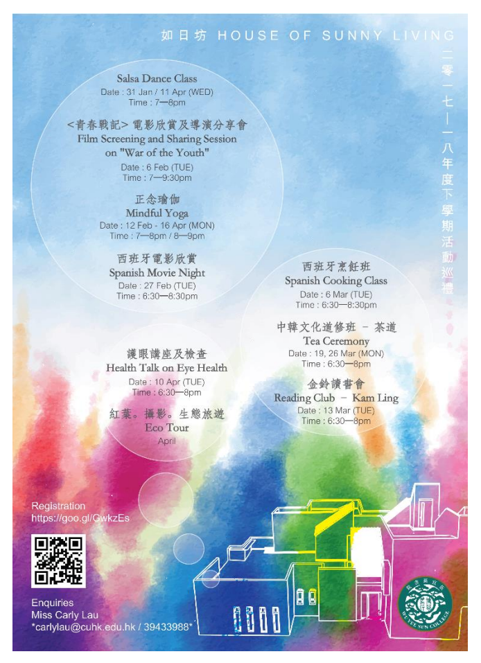
精選活動如下: Activities are highlighted as follows:

新的學期,如日坊為同學準備了各種有益身心的活動,旨為大家注入正能量,以迎接每一天的挑戰。活動多不勝數,總有一款會適合你! With the new start of the semester, House of Sunny Living has prepared a wide variety of activities to strengthen your mind, body and spirit, and instill you with positive energy for every new challenge!