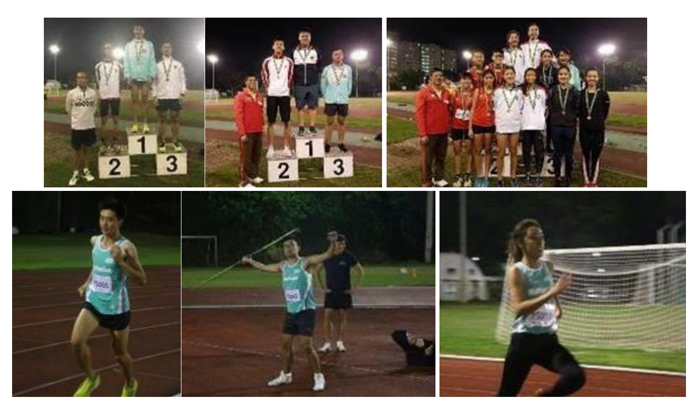
10. CUHK Athletic Meet 2017