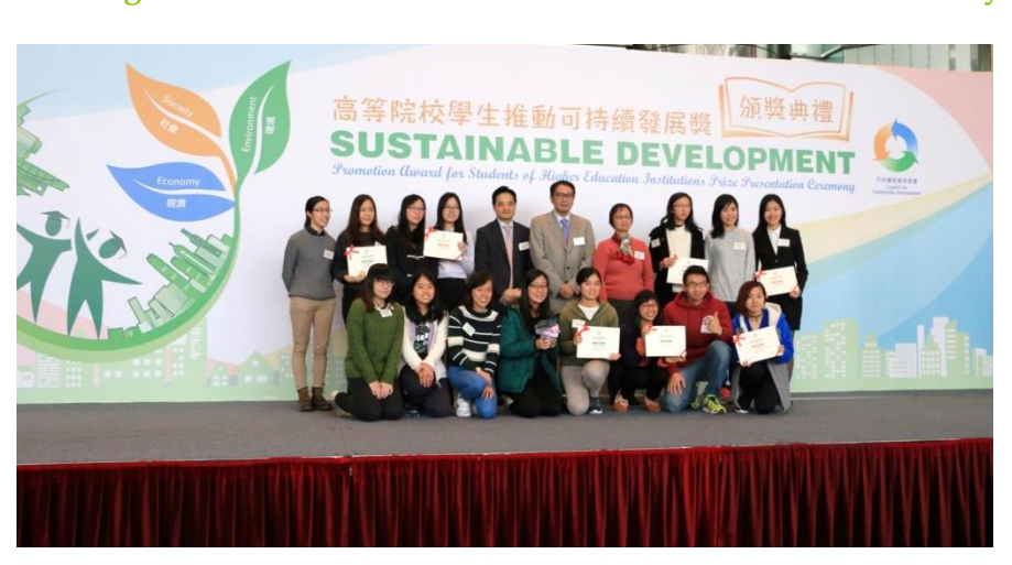
6. College students awarded in SDPA Prize Presentation Ceremony

Two groups of student teams mainly formed by our Sunnies with other CUHK students attended the Prize Presentation Ceremony of the Sustainable Development Promotion Award for Students of Higher Education Institutions (SDPA) at 26<sup>th</sup> Feb afternoon to receive their awards and share their project ideas to the public in the Fortune Metropolis Mall in Hung Hom.