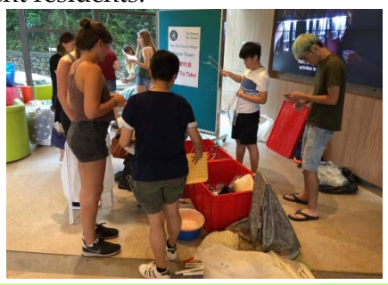
5. Delegation from Shenzhen University 深圳大學到訪書院

A freecycling event organized by the College Green Team was held for our College residents last weekend. The items offered were collected from residents of the past semester, and they all have a new owner now! This meaningful event will be held again next year, and we hope to receive full support from our current residents!