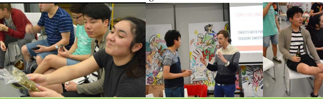
6. French & German SURVIVAL Language Course

To explore different cultures, there's no better way to start with local food. Our College International Team, A Store in CUHK (山城士 多) and a group of international students co-organized the food-tasting night on 5<sup>th</sup> April to share and learn from each other's experiences of local cultures. More than 20 international and local students excitedly share their favourite local food, exchanged the views of "small shops" and street food stalls. The discussion became more amusing when the hosts introduced the producers' stories while the participants tasting locally-produced Chinese pastries, sweets and beer. The participants had not only learned more about Hong Kong cultures, but also made new friends from various regions.