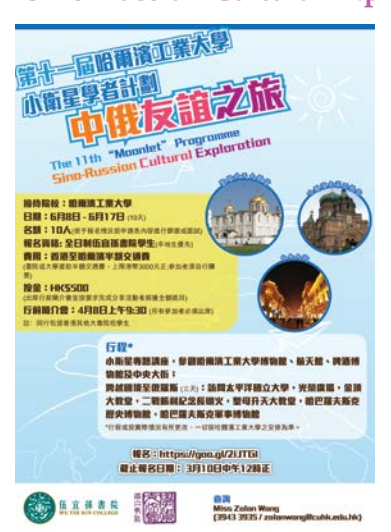
The 11th "Moonlet" Programme - Sino-Russian Cultural Exploration (Chinese Version Only)

由書院及學術交流處(國內事務)合辦、哈爾濱工業大學(哈工大)接待的<u>小衛星學者計劃-中俄友誼之旅</u>現正接受報名! 想於暑假衝出香港,探索未知的國度? 一起出走到俄羅斯、哈爾濱吧!