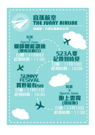
院慶第一炮 - 523 人宴

1. College Anniversary Celebration 院慶慶祝活動 - Sunny Airlines (Tomorrow, Wednesday & Friday!!)