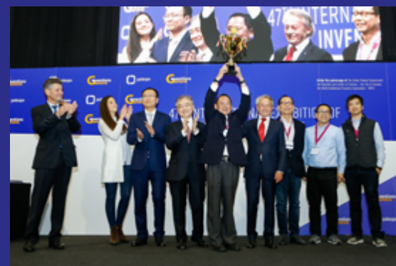
Grand Prix 2019 - for GRST Holdings Limited from Hong Kong for the first recyclable car battery.