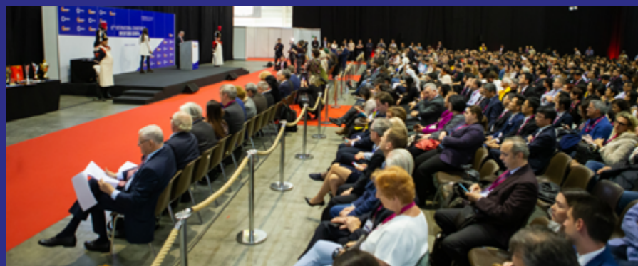
More than 1'000 exhibitors, personalities and journalists participate at the prize-giving ceremony