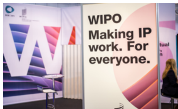
Stand of WIPO (World Intellectual Property Organisation) and IPI (Swiss Federal Institute of Intellectual Property)

The International Exhibition of Inventions of Geneva benefits from the most extensive support and privileges that can be granted to an exhibition. It is under the patronage of the Swiss Federal Government, the State, the City of Geneva and of the World Intellectual Property Organization - WIPO.