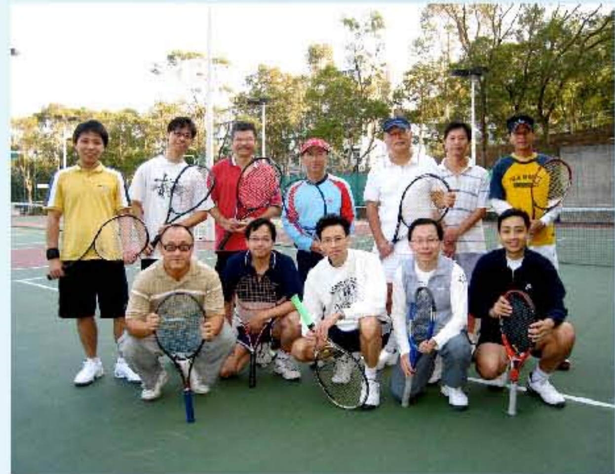
Participants of the Friendly tennis match 2009