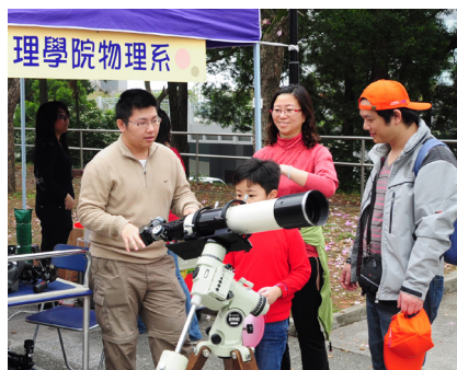
Visitors had a hands-on learning experience at the Physics Department booth.