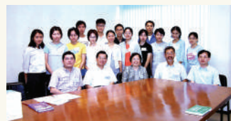
首屆入讀香港中文大學中醫學士學位課程同學與教授合照 (攝於1999年) In 1999, teachers take a photo with the inaugural class of the Bachelor of Chinese Medicine.

中醫學院 成立，並於2013年脫離理學院，轉至隸屬醫學院 The School of Chinese Medicine established, which was subsequently migrated to the Faculty of Medicine in 2013