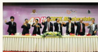
生物化學40周年高桌晚宴 Biochemistry 40 th Anniversary High Table Dinner

生物化學系 成立，該學系是理學院和醫學院共同創立而成 Department of Biochemistry – a joint venture of the Faculties of Science and Medicine – established