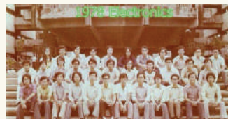
1978年電子學系畢業班 Class of 1978, Department of Electronics

電子工程學系 成立，並於1991年脫離理學院，轉至隸屬工程學院 Department of Electronic Engineering established, which was subsequently migrated to the Faculty of Engineering in 1991