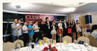
統計學系校友會慶祝學系三十周年 (攝於2012年6月15日) Alumni Association of Department of Statistics celebrated the 30 th Anniversary of the Department (15 June 2012)

統計學系 成立 Department of Statistics established