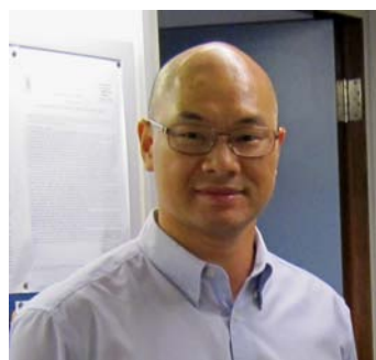
Prof. LIU Renbao

P rof. LIU Renbao of the Department of Physics made a key breakthrough towards ultra high-speed optical communication that has potential to speed up the current Internet by 10,000 times. The research findings have been recently published in the prestigious journal Nature .