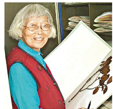
秀苑擷英 [ 秀苑英華雜誌文集 ]