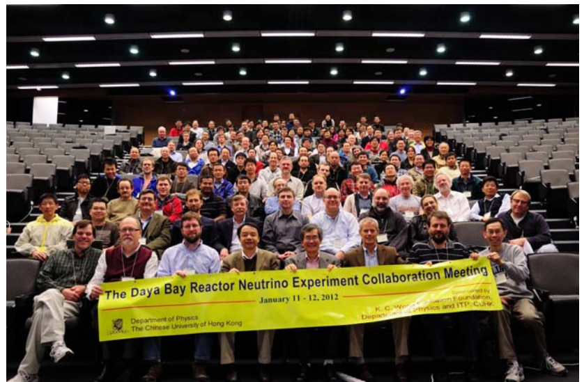
The Daya Bay Collaboration consists of scientists from mainland China, the U.S, Hong Kong, Taiwan, Russia and the Czech Republic.

The results have opened the door to further investigations and will influence the design of future neutrino experiments to determine the most massive