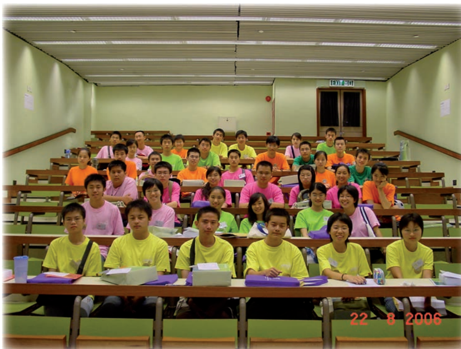
Group photo of 2006/2007 Science Stream Year 1 students