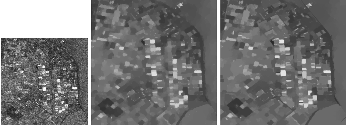
Figure 6: Left: Real multi-look SAR image (copyright by [34]) of size 512 \times 512 with values in [0, 255] . Middle: Restoration result by the I -divergence constrained model (16) with the total variation seminorm applied to the squared image. Right: Result by the I -divergence constrained model (16) with the nonlocal term ( l = 9 , \omega = 13 , a = 3 ) applied to the squared image.

solution of I -divergence constrained least squares problems in each iteration step k . To solve these problems one can utilize that the corresponding least squares problem with penalized I -divergence has an analytical solution \hat{t}^{(k)}(\lambda^{(k)}) which depends on the regularization parameter \lambda^{(k)} . Fortunately, there exists a unique parameter \hat{\lambda}^{(k)} which solves the discrepancy equation D(b, \hat{t}^{(k)}(\lambda^{(k)})) = \tau . This \hat{\lambda}^{(k)} can be efficiently computed by Newton's method. It turns out that the sequence \{\hat{\lambda}^{(k)}\}_k converges to the regularization parameter \hat{\lambda} for which the penalized problem (17) has the same solution.