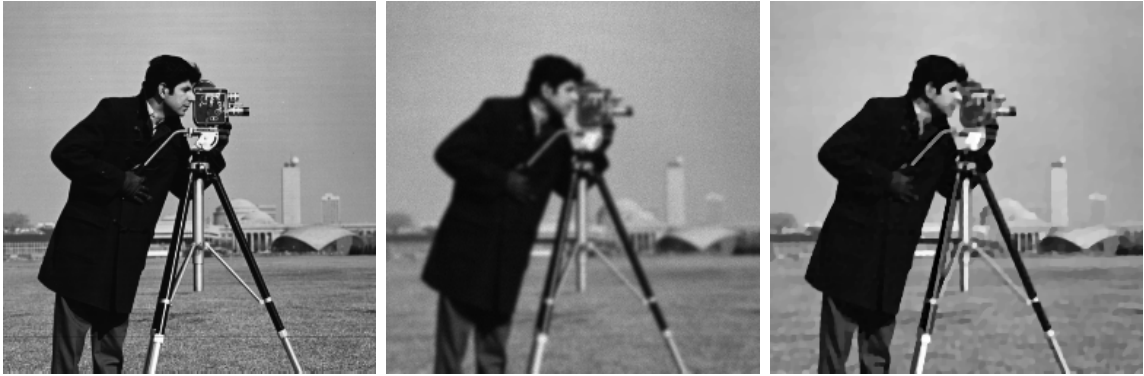
Figure 3: Result for the whole 'cameraman' image. Left : Original image of size 256 \times 256 with values scaled to [0, 3000] . Middle : Corrupted image. Right : Restoration result by the I -divergence constrained model (16) with total variation seminorm.

2.64n is depicted on the right. For computing this solution we used again Algorithm I. The occurring linear system of equations is solved here by a CG method, since due to the sparsity of the relevant matrices the CG method turned out to be even faster than a straightforward, non-optimized implementation of the cosine II transform. Since H is the identity matrix, the non-negativity of x is guaranteed by the I -divergence constraint. Therefore, we can simplify the algorithm by omitting the constraint x \geq 0 and thus the variables y_3 and q_3 in the algorithm. This is equally true for the PDHGMP Algorithm II, where st < 1/\|(I L^T)\|_2^2 is guaranteed for st < 1/9 . Alternatively, we can also use the predictor-corrector ADM Algorithm III, here. In Table 1 a speed comparison between these algorithms for 'trial and error' optimized parameters \gamma , s and t with respect to the error measure \|x^{(k)} - x^*\|_\infty is provided. The sufficiently converged reference result x^* is obtained by Algorithm III. As the