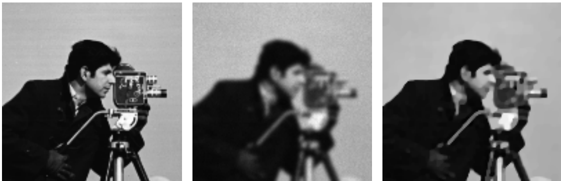
Figure 1: Left: Original image with values scaled to [0, 3000] so that the brightest pixels correspond to 3000 detected photons. Middle: Corrupted image blurred by a Gaussian kernel (standard deviation 1.3) and contaminated by Poisson noise. Right: Restoration result by the I -divergence constrained model (16) with total variation seminorm.

Our first test image in Figure 1 shows a part of the 'cameraman' image, which has been corrupted by a Gaussian blur and contaminated by Poisson noise. The image gray values are here interpreted as photon counts in the range [0, 3000] . For synthetically adding Poisson