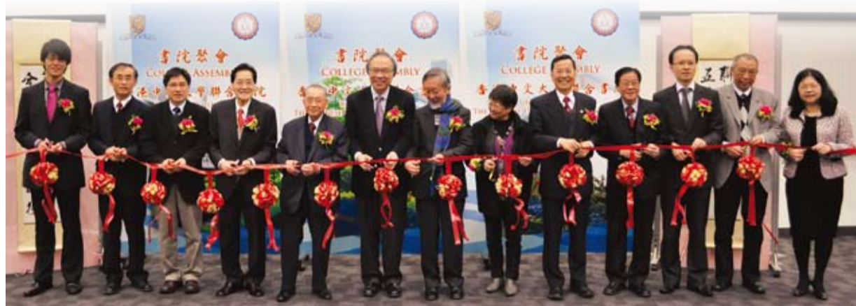
主禮嘉賓剪綵，為聯合書院五十五周年慶祝活動展開序幕 Ribbon-cutting was conducted at the ceremony

conferences, academic programmes, cultural and art programmes, health series, student and alumni activities will be launched. For details, please refer to the 55th Anniversary Activities webpage: www.cuhk.edu.hk/uc/uc55 .