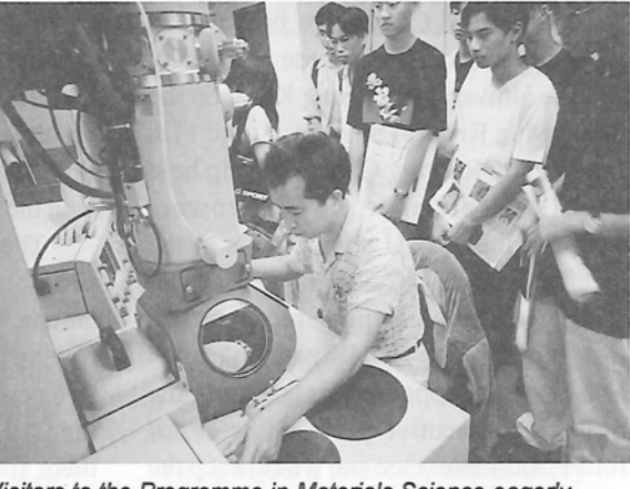
Visitors to the Programme in Materials Science eagerly watch how the transmission electron microscope is operated

Over 16,000 local students visited the CU campus on the Orientation Day for Sixth-Formers held on 4th October. The University's seven faculties as well as their teaching facilities were open to the visitors. Detailed information about some 40 undergraduate programmes was supplied. There were also open-air performances, video shows, exhibitions, and counselling sessions.