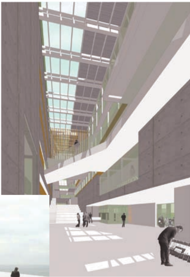
建築學院新大樓的設計貫徹環保原則 The new teaching block of the School of Architecture is designed with green features