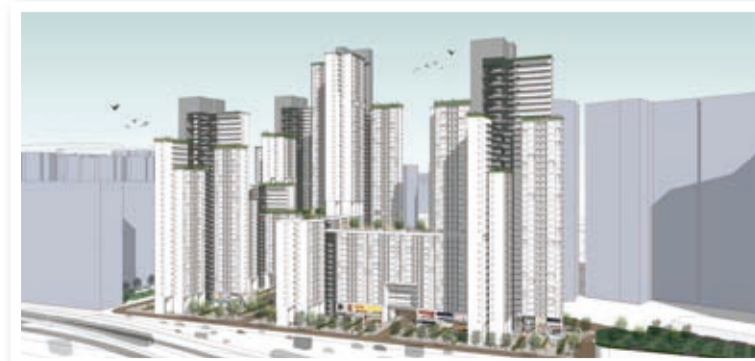
梁鈺玲設計的公屋增設空中花園 Kelly Leung introduces rooftop gardens to public housing towers

中大建築學院於5月16日至20日舉辦第十四屆建築碩士畢業展，主題為「傳承」，由發展局局長林鄭月娥女士、香港建築師學會副會長黃錦星先生，以及建築師事務商會副主席林光棋先生主禮。包括梁鈺玲在內的三十六名畢業生透過繪畫、攝影、文字和建築模型等不同媒介演繹其設計理念，表達建築與城市之間的關係，題材包括建築技術研究、居住質素探討、建築文化與教育、城市轉化更新等。