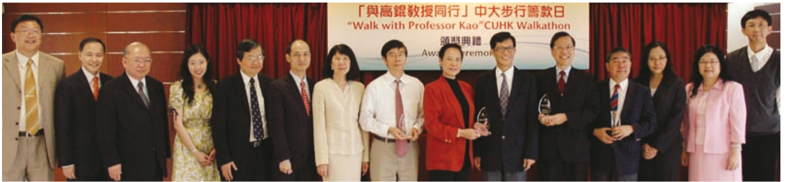
步行籌款得獎者與嘉賓合照 Walkathon award winners and guests

獎學基金將撥出部分金額，設立「高錕教授科研交流生獎學金」，資助工程學院及物理學系本科生赴海外交流及參與研究計劃。本年度共有八個名額，每名學生將獲資助旅費及生活費共港幣三至五萬元，到英美頂尖學府如加州大學柏克萊分校、麻省理工學院、史丹福大學、倫敦帝國學院等交流，為期最短十星期。