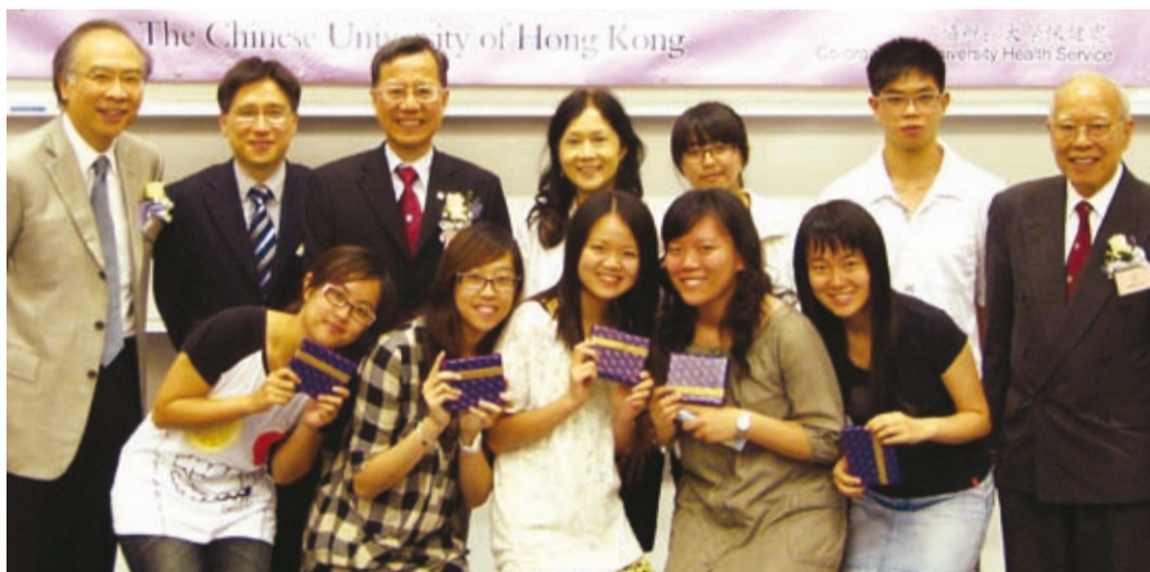
聯合書院隊伍代表獲頒傑出活動獎 United College representatives receiving the Best Project award

健康促進及防護委員會及保健處合辦的2009-10校園保健大使計劃於5月19日舉行畢業典禮，頒發證書給四十七位保健大使。四位學生獲選為傑出保健大使，聯合書院則獲傑出活動獎。多位保健大使在典禮中分享過去一年籌辦書院、校內及社區健康推廣活動的經驗。