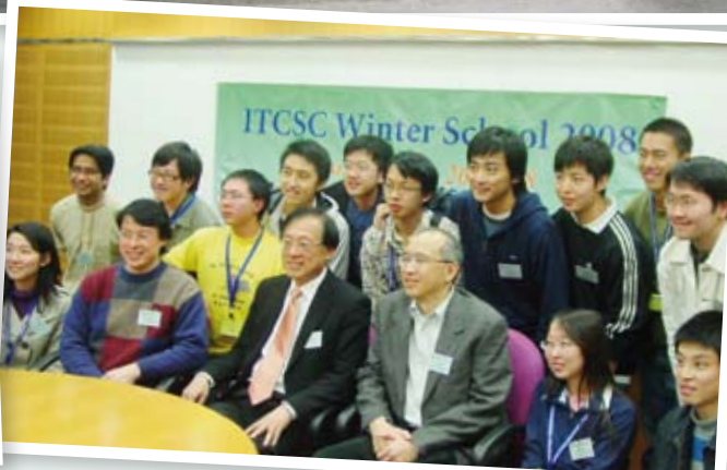
亞洲大學高材生參加中大首屆理論計算機科學冬季課程 CUHK's First Theoretical Computing Winter School for Elite Students from Top Asian Universities