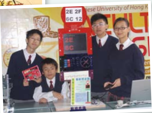
工程學院機械人及科技教育中心成立 New Centre for Robotics and Technology Education