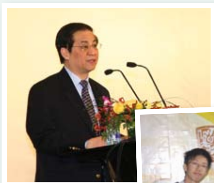
中國公司治理的機遇與挑戰論壇 Forum on Corporate Governance in China

Details of the following news are available at: www.cuhk.edu.hk/iso/newsletter/