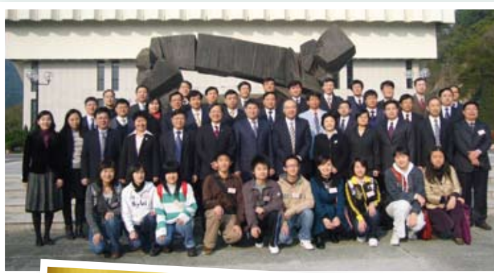
山東大學萌芽學者到訪 Budding Scholars from Shandong University