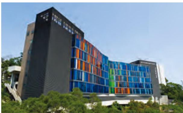
Run Run Shaw Science Building