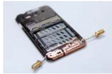
The prototype of testing CRDN in a smart phone with dual antennas