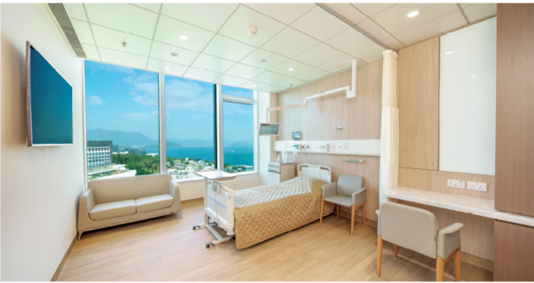
一人房 1-bed room