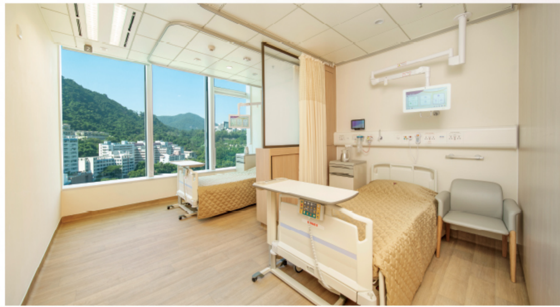
二人房 2-bed room