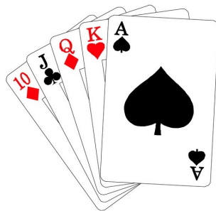
Figure 3: Straight