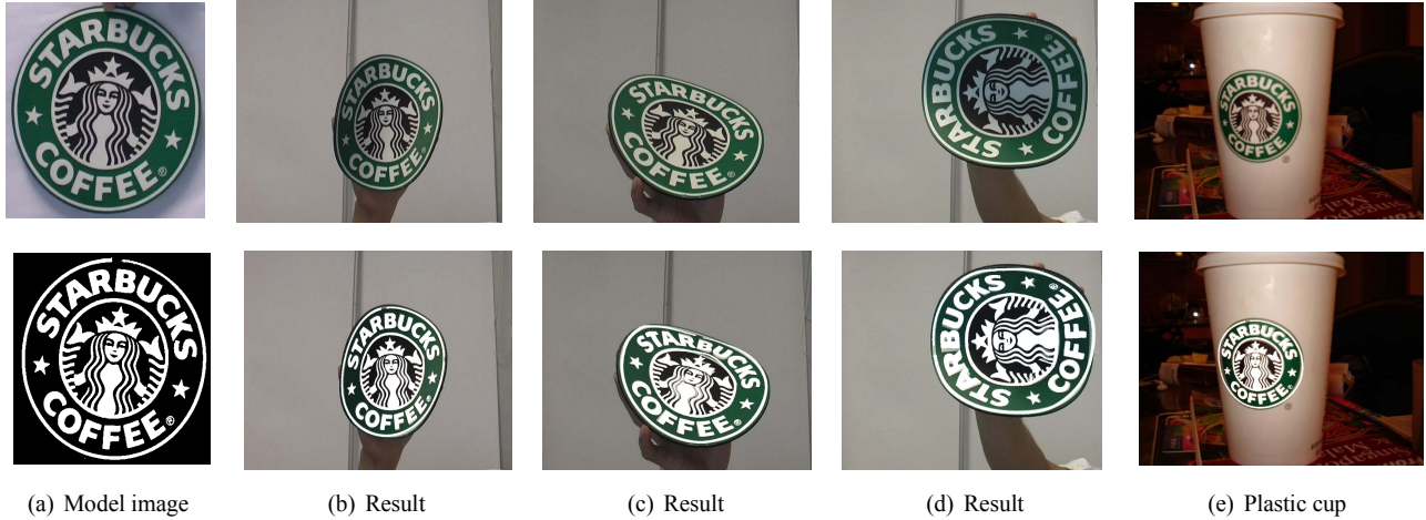
Figure 3. We use a Starbucks pad as the deformable object. The model image is shown in (a) the contour of the model image is extracted using a simple gradient and filling operator, which is overlaid on the input image. (b) to (d) show the results. (e) shows the result where the pad is replaced by a plastic cup. The model contains 120 vertices, and the whole process, including image capturing and rendering, runs around 18 frames per second. More results are included in the supplementary material.