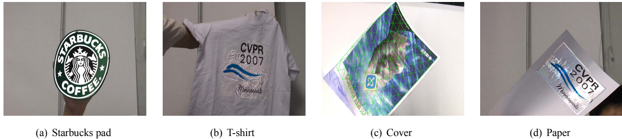
Figure 1. Detecting nonrigid surfaces in real-time video (a-d). (a) The contour is overlaid on the Starbucks pad. (b) T-shirt with shadow. (c) The cover of a magazine. (d) A piece of paper with specular reflection.

quadratic optimization problem, which has a closed-form solution for a given set of observations. Thus, it can be efficiently solved through LU factorization. Then, a progressive sample [5] scheme is employed to initialize the optimization scheme, which can decrease the number of trials significantly. Therefore, the present approach requires much fewer iterations than the semi-implicit iterative optimization scheme [20]. Thus, the proposed method is very efficient for real-time nonrigid surface recovery tasks. To evaluate the performance of our proposed algorithm, we conduct extensive experiments on such diverse objects as a Starbucks pad, a T-shirt, and the cover of a magazine, as shown in Fig. 1.