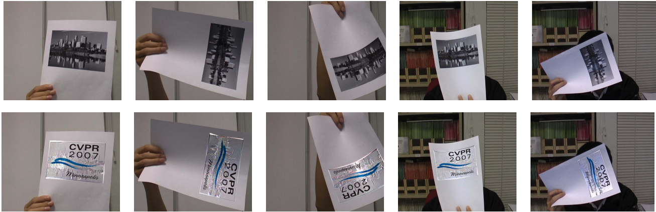
Figure 6. Re-texturing a picture on a piece of paper. The first row is the 720 \times 576 images captured by a DV camera. The second row is the results of replacing the picture with the CVPR logo.