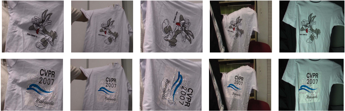
Figure 5. Re-texturing of a shirt print. The first row shows the 720 \times 576 images captured by a DV camera. The second row shows the results of replacing the bunny with the CVPR logo.

done by the GPU and requires only a short OpenGL shading language program; and the whole process runs at about 17 frames per second. Fig. 5 shows the results of re-texturing a T-shirt with a Lambertian surface. It is difficult to estimate a blank shaded image due to dividing near zero intensity values and the use of an uncontrolled optical sensor. However, the visual effect is that the bunny in the input video is re-textured by the CVPR logo. For a specular surface, Fig. 6 describes the results on a piece of paper with a saturated region. In addition, the right two columns of Fig. 6 show the results in a cluttered environment.