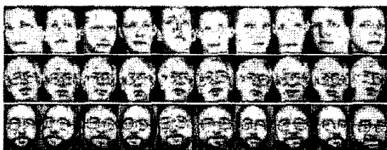
Fig. 2. A snapshot of the ORL face database for 3 people.