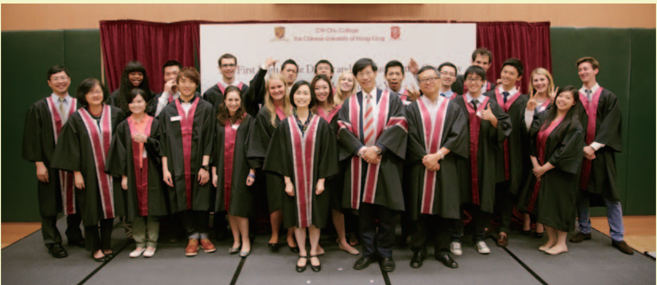
College Fellows and incoming exchange students, taken at the First High Table Dinner on 3 September 2013