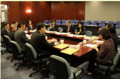
The first meeting of the Committee of Overseers on 14 November 2012

Similarly, Founders' Day in 2013 will be celebrated on 12 November. There will be a meeting of the Committee of Overseers in the afternoon, followed by a High Table Dinner in the evening. Since this is the 50th Anniversary of CUHK and also five years since the establishment of CW Chu College counting from the amendment of the CUHK Ordinance, this event is billed as 'CU 50 : CWC 05' and has been approved as one of the celebratory activities for the University's anniversary.