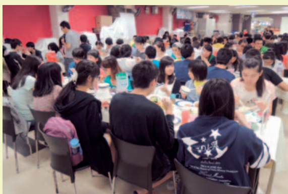
Communal dinners are organized three times a week