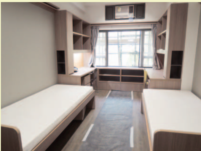
A mock-up bedroom