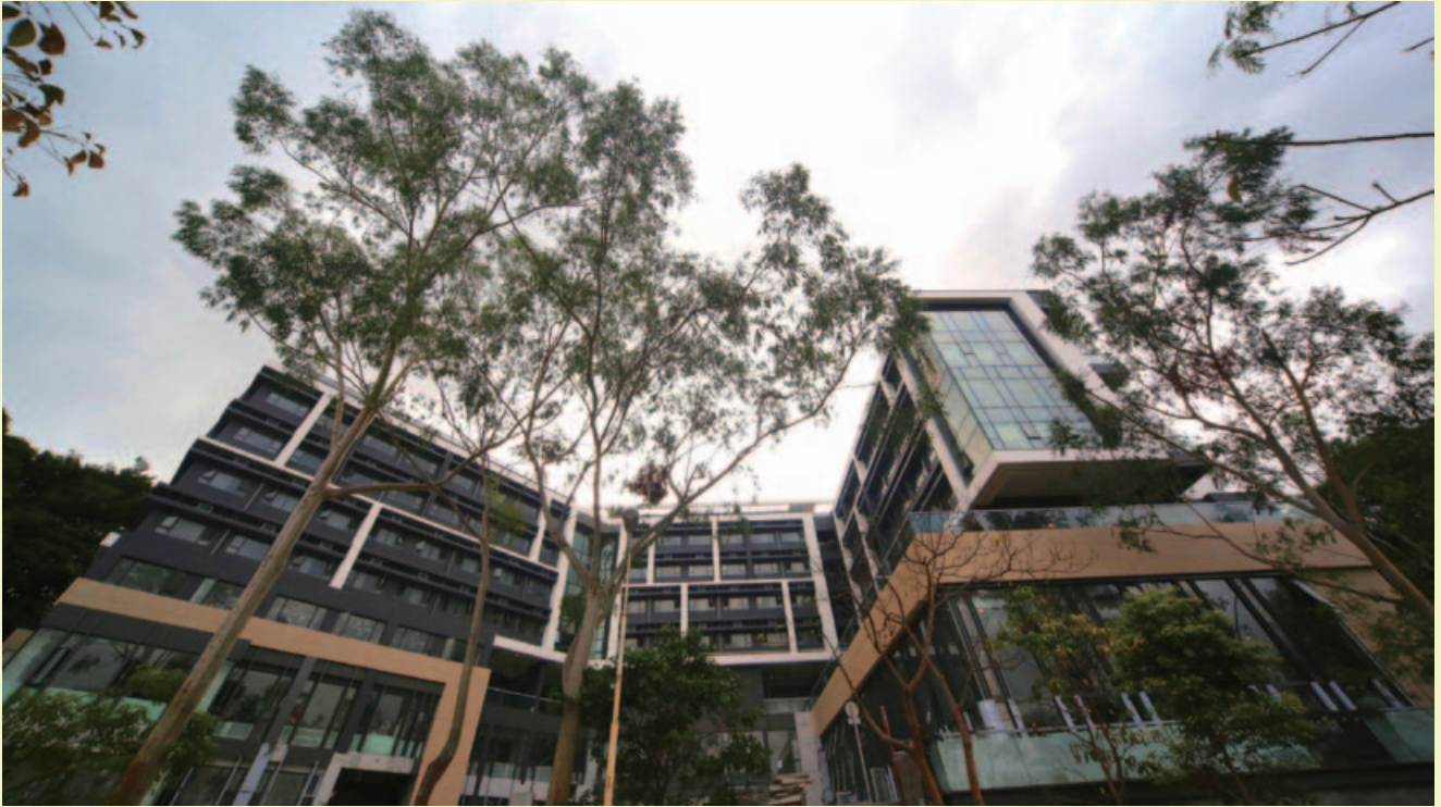
The new CW Chu College Campus at Campus Circuit North as of 11 November 2013

Staff and students look forward to moving to the new premises at the end of December 2013, and to begin Term 2 in the new facilities.