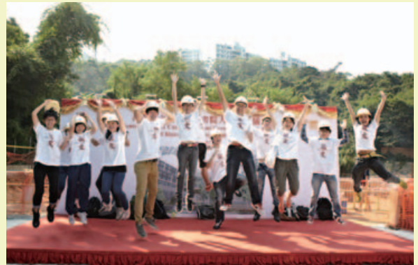
Students attending the Contract Work Commencement Ceremony on 14 November 2012

Members of the College were delighted that the foundation work for the College premises was completed in the third quarter of 2012. The superstructure was tendered, and the contractor selected, China Resources, took possession of the site and held a Contract Work Commencement Ceremony on 14 November 2012. Members of the College, including many students, were present at the site together with colleagues from the Campus Development Office and other units.