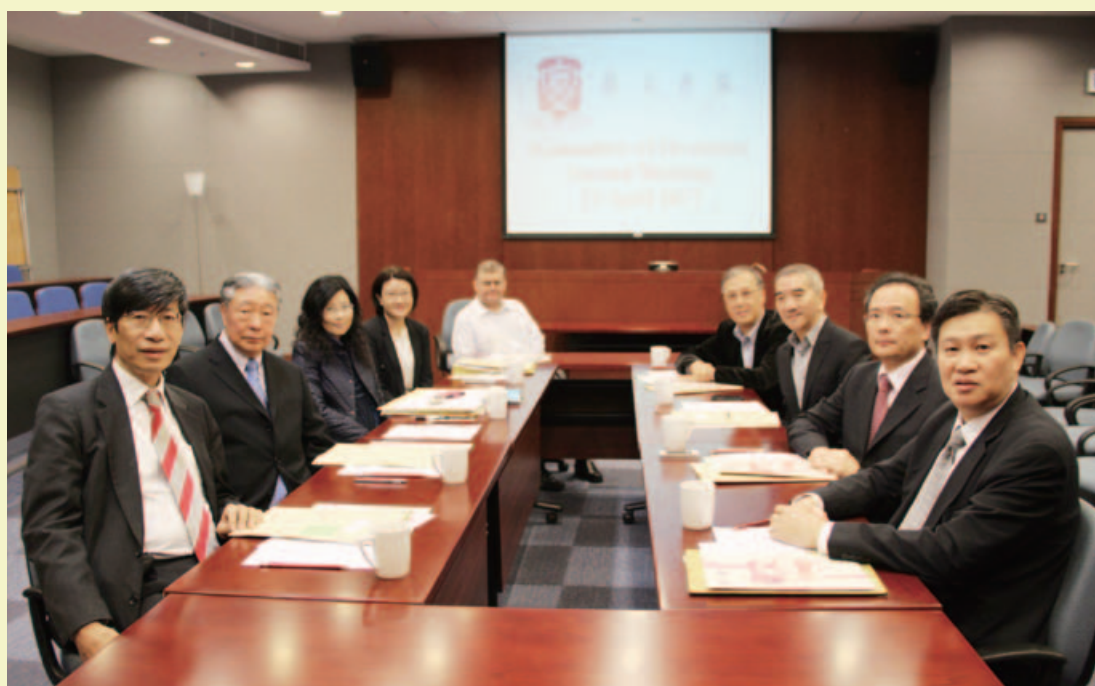
The second meeting of the Committee of Overseers held on 22 April 2013