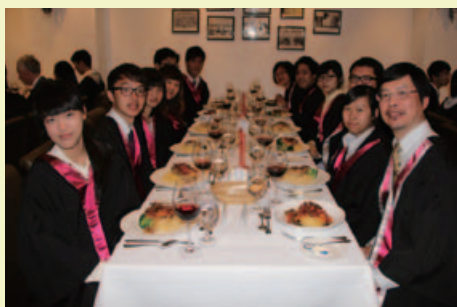
College teachers and students enjoying the High Table Dinner

In addition to regular Communal Dinners, a number of more formal High Table Dinners are organized every academic year. Students and teachers attend in college gowns, and usually a speaker is invited, and there may be performances. Following the inaugural event in September 2012 that was part of the Orientation Camp for the founding cohort, four more High Table Dinners were held in the academic year 2012–13. In the first term of the academic year 2013–14, the first High Table Dinner was held on the second day of class to inaugurate the academic year, and the second one on Founders' Day in November.