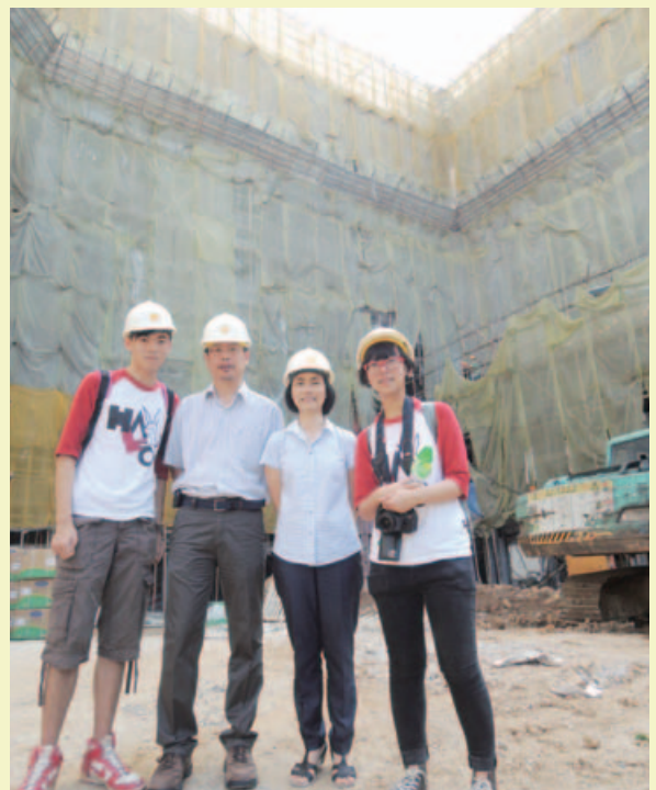
College members visiting the new campus to look at the interior finishing and details on 11 September 2013