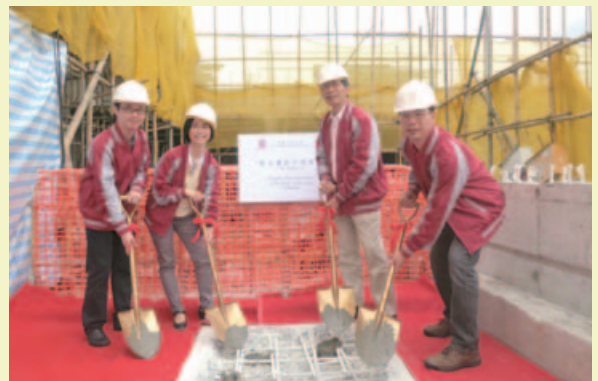
Members of the Hostel, Building and Campus Management Committee at the topping-out ceremony on 16 May 2013