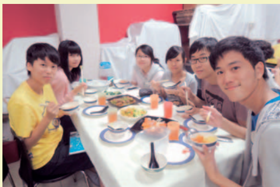
Six students sitting at one table during communal dinner