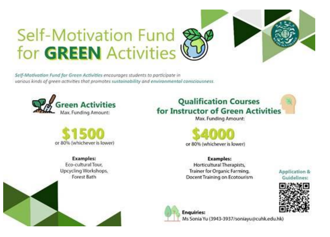
Self-Motivation Fund for Green Activities encourages students to participate in various kinds of green activities that promotes sustainability and environmental consciousness.

1. Self-Motivation Fund for Green Activities