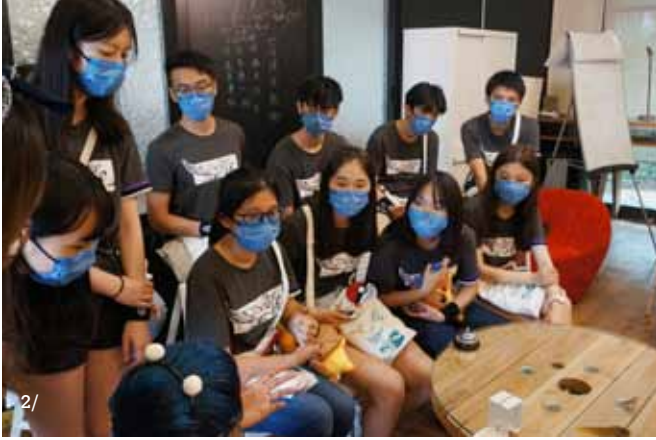
2/ Mass Games 小組競技

To let them get to know their teammates, they had a series of mass games enhancing their teamwork. Their bonding and coordination were challenged in the Detective Game and Escape Game. Other than adjusting the programme according to number of participants, the City Hunt was transformed into the CU Hunt, in which they got familiarised with the campus they are going to call home for the next few years. They had to complete tasks at different spots on the CUHK campus, and the executive committee members would introduce to the freshmen corresponding stories behind. Although the activities were greatly bounded by different restrictions under the pandemic, the physical distance, however, could not tear them apart. Both the senior and junior Sunnies treasured the time they spent together, sharing laughter in the two-day camp. The most important take-away is that they got to think about their own identity and goals they wish to achieve in the coming years.