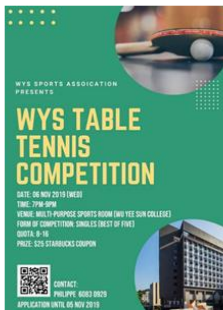
Table Tennis Competition 伍宜孫書院乒乓球賽