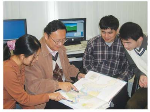
Students and the supervisor

Students can study in either one year full-time or two years part-time programme.