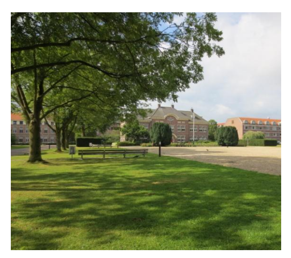
Campus of University College Utrecht