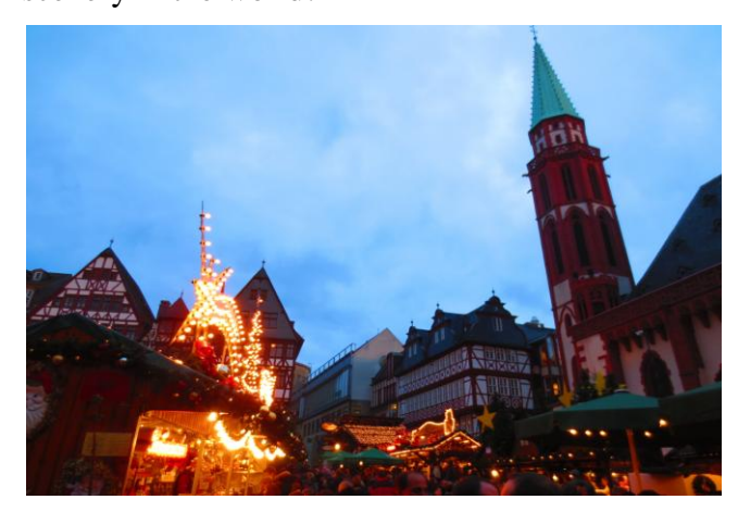
Christmas market in Germany

time, its beautiful natural landscapes are amazing as well. I was shocked not only by the fantastic masterpieces by many famous artists but also the unbelievable scenery in many European countries. The advantages of exchange in the first semester were that I could celebrate the Christmas with the local people in a traditional European way and saw the beautiful snow in the Alps. The most impressive experience for me was my trip to Hallstatt, which is a world heritage village in Austria. I'd never imagined that I could go there by myself and see the most amazing and awesome scenery in the world!