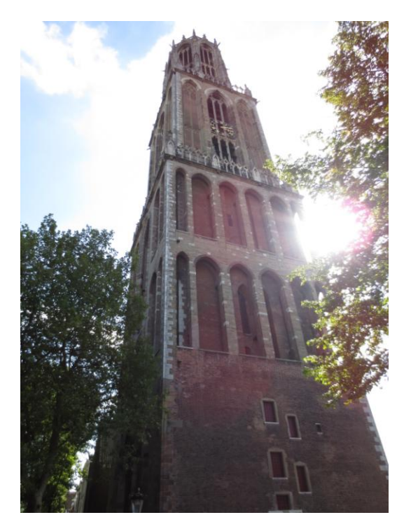
Dom Tower in Utrecht